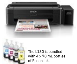
The L130 is bundled with 4 x 70 mL bottles of Epson ink.

Superb Savings and Page Yield A low-cost bottle of black ink delivers an ultra-high yield of 4,500 pages for substantial savings.